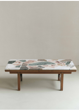
5.6 70s coffee table Unknown