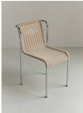
1.3 Bauhaus style chair Unknown