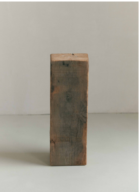
6.2 Wooden pedestal Unknown