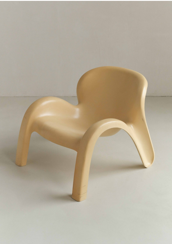
2.1 GN2 fauteuil Peter Ghyczy