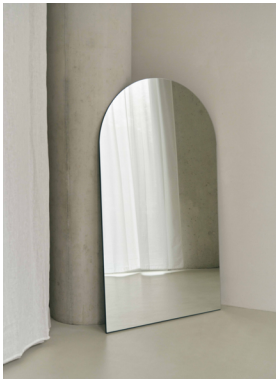
6.5 Mirror Meen