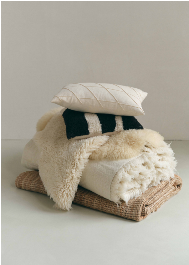
6.4 Fabrics & rugs Various