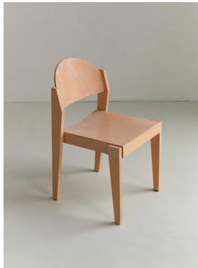
1.6 Wooden chair Unknown