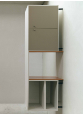
5.4 Vintage 70s desk Behr