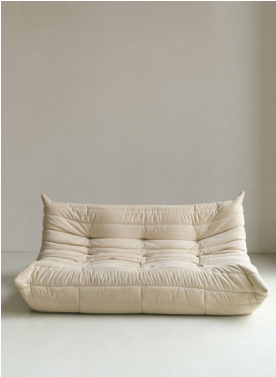
3.2 Togo sofa Ligne Roset