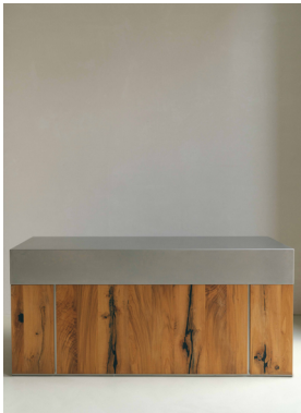
5.3 RVS & wood bar Unknown