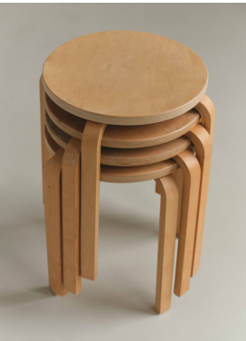
4.1 Frosta stools (4) Ikea