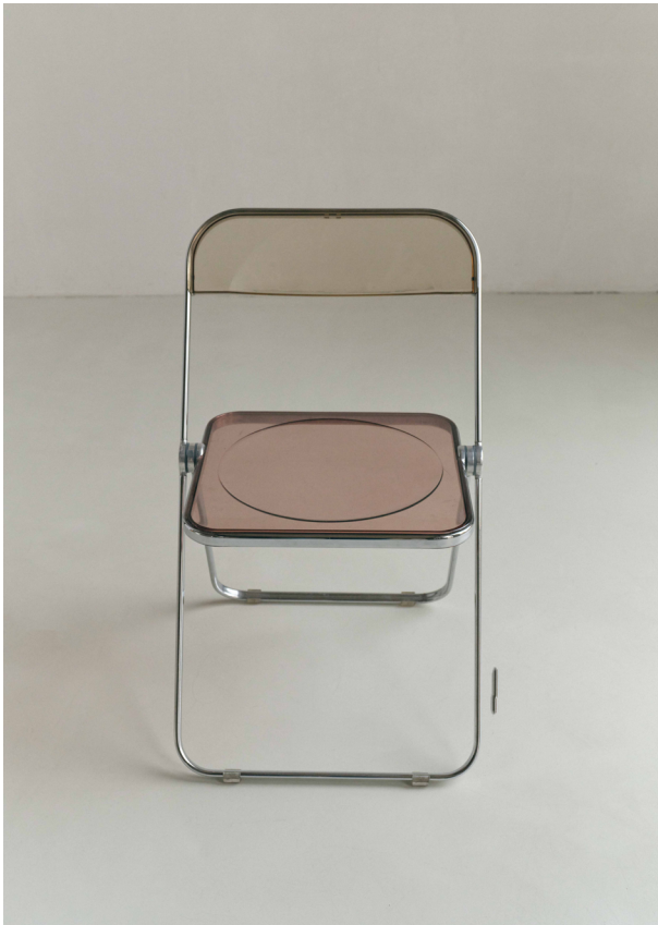
1.4 Plia chair (2) Anonima Castelli