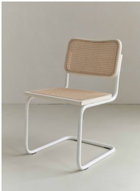
1.5 Cesca chair Marcel Breuer