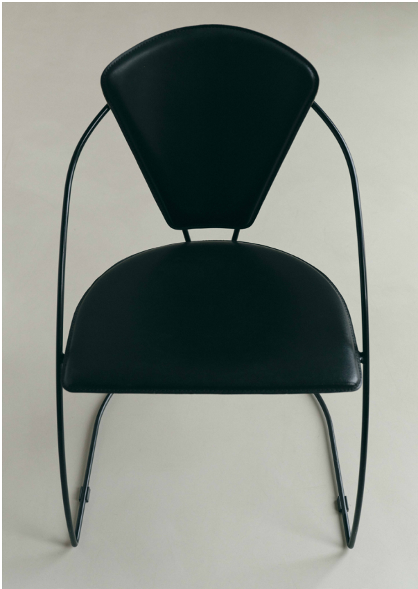
1.10 Linda chair Arrben