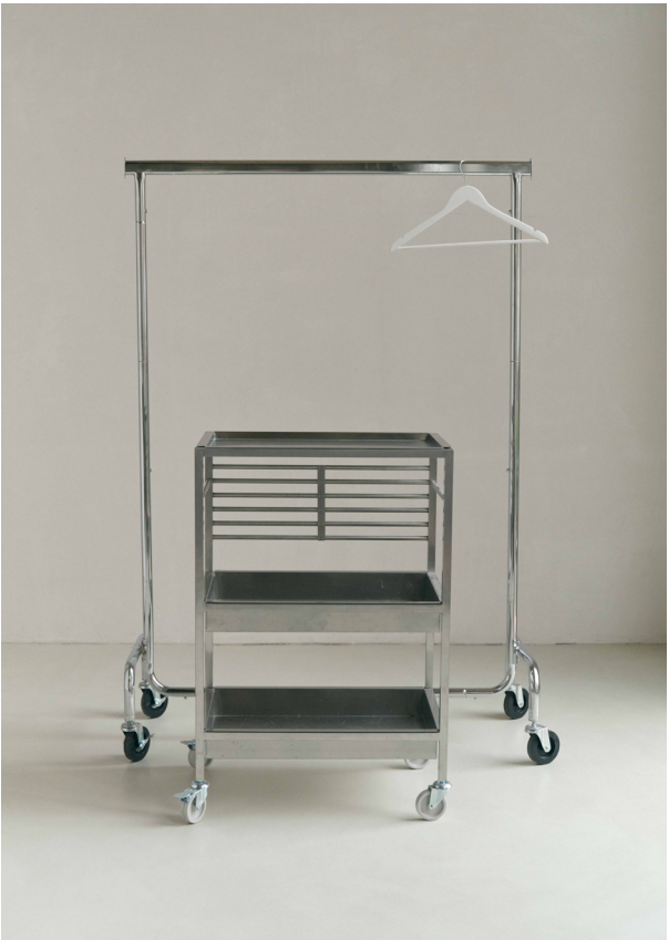
6.7 Photo/styling gear Various