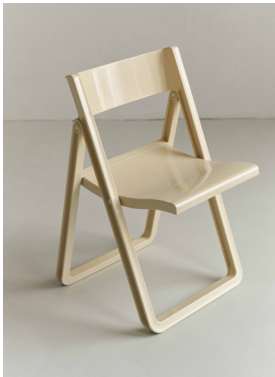
1.2 Folding chair Allibert