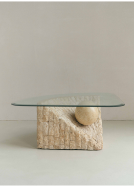
5.5 Mactan object Magnussen Ponte