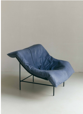
2.3 Butterfly fauteuil Gerard van den Berg