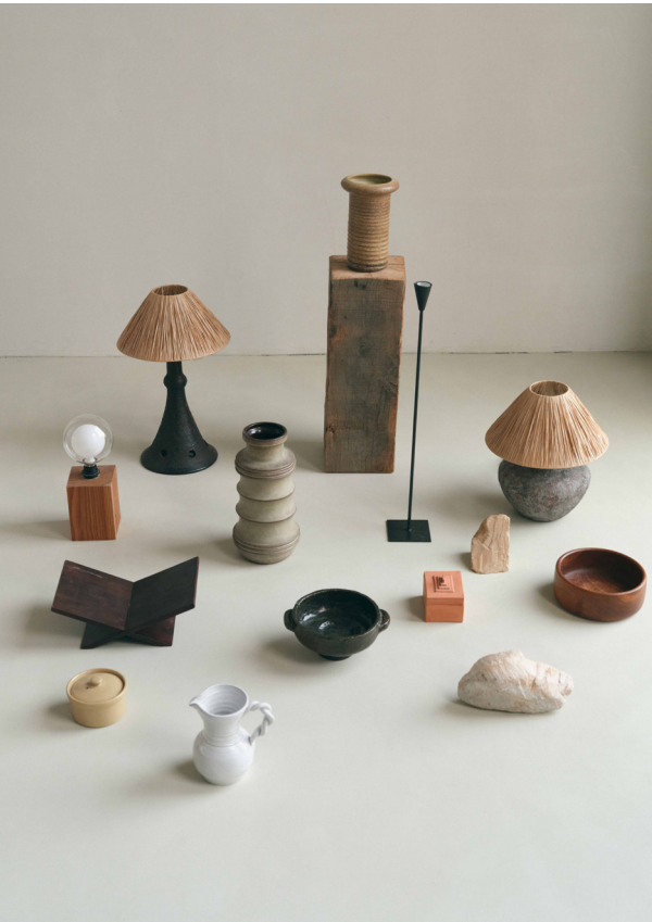
6.1 Vintage accessories Various