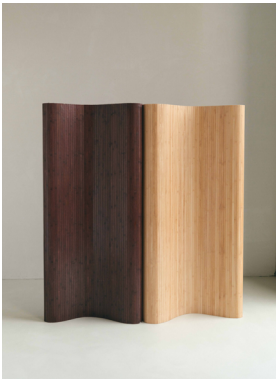
6.6 Roomdividers (3) Unknown