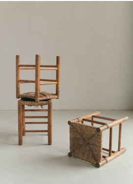
4.2 Rattan stools (3) Unknown