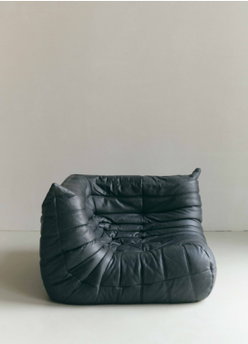
2.2 Togo corner seat Ligne Roset