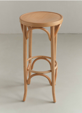
4.3 Wooden high stool Unknown