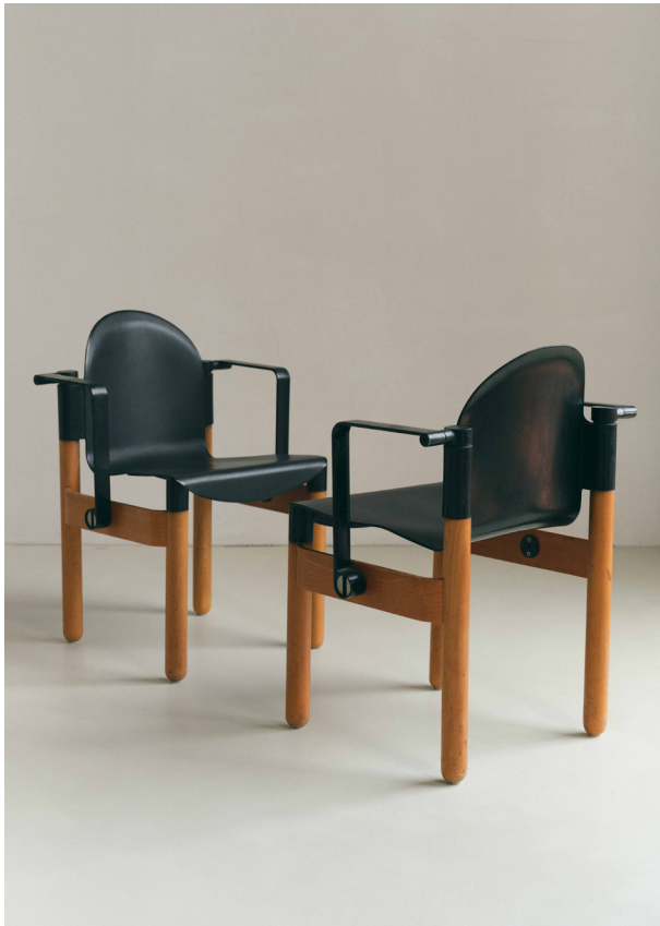
1.7 Thonet chair (2) Gerd Lange