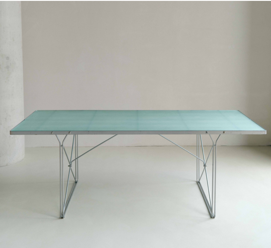
5.1 Momentum dining table Niels Gammelgaard