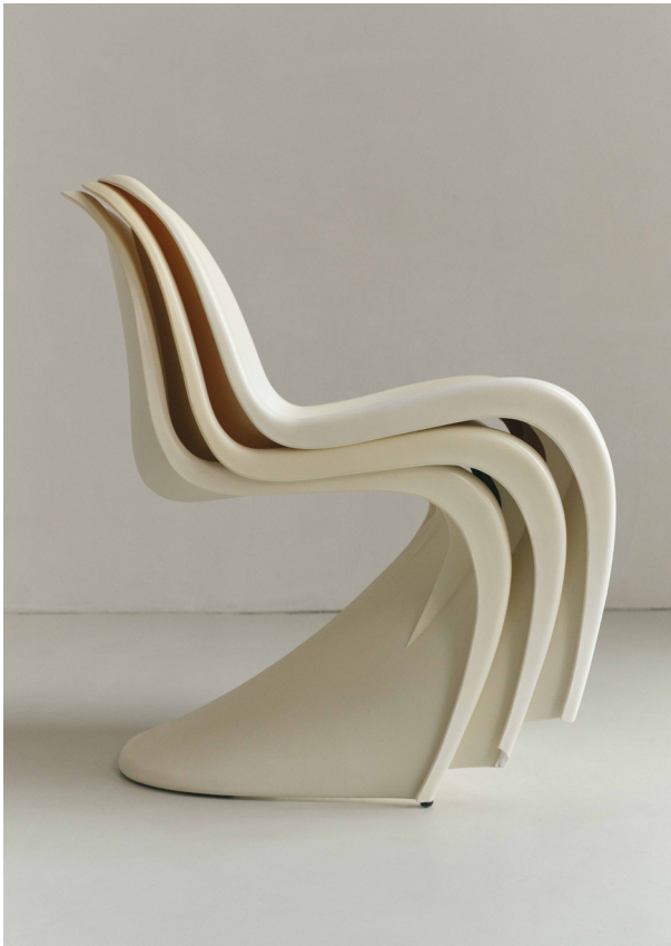
1.1 Panton chair (3) Vitra