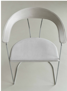
1.8 Italian style chair Unknown