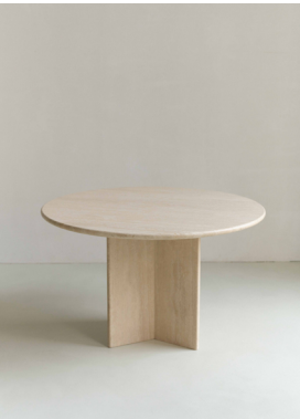
5.2 Travertin dining table Unknown