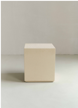
6.3 White pedestal Unknown