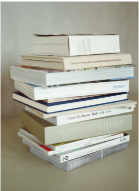
6.8 Books & magazines Various